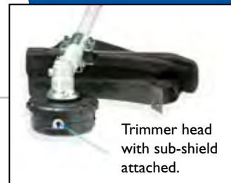
Trimmer head with sub-shield attached.