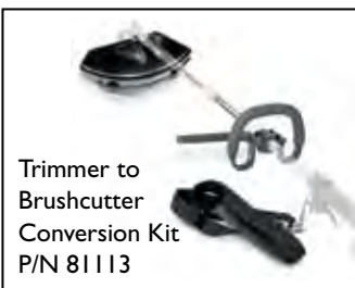
Trimmer to Brushcutter Conversion Kit P/N 81113

Strap with hip pad for safety and to help reduce fatigue